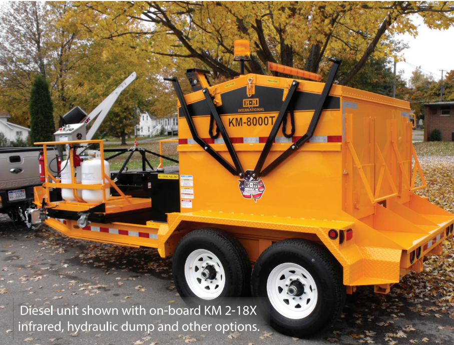
Diesel unit shown with on-board KM 2-18X infrared, hydraulic dump and other options.