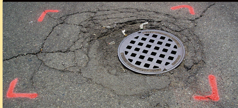
^ Before v After